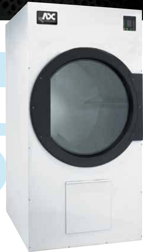
AD-115 OPL Dryer