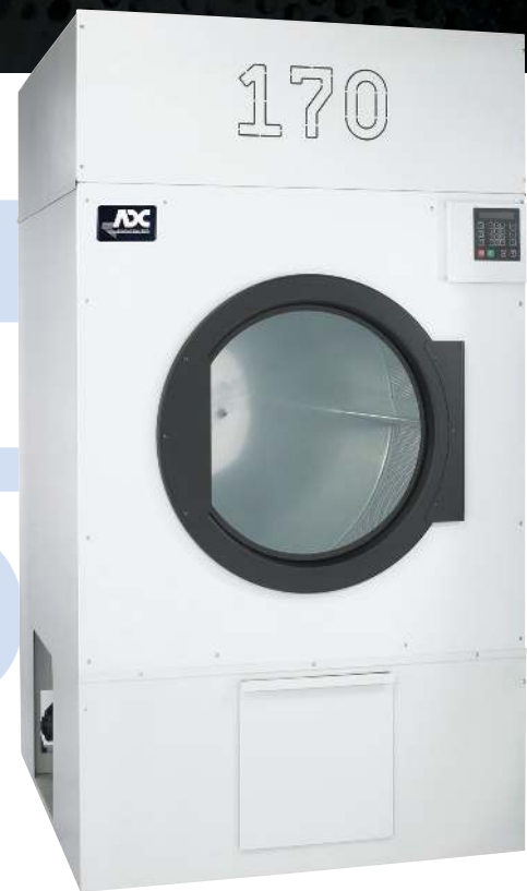
AD-170 On-Premise Dryer