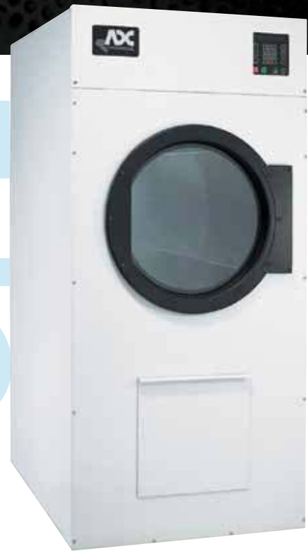
AD-50V OPL Dryer